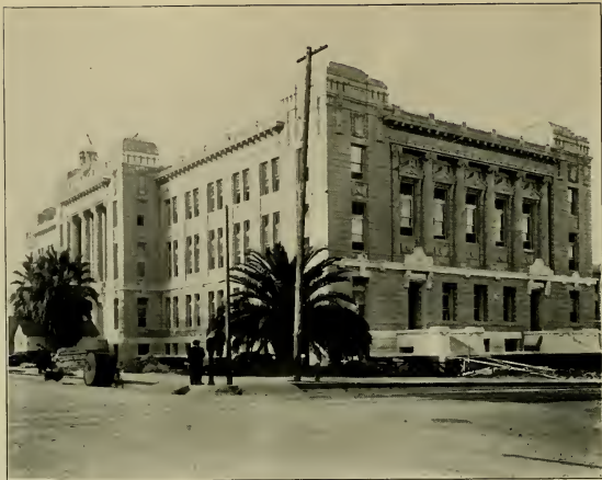
NEW COURT HOUSE